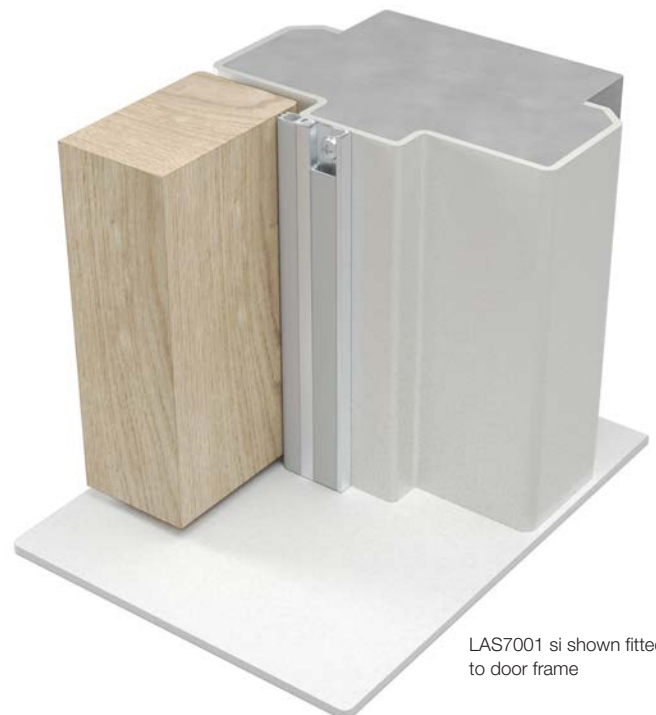
LAS7001 si shown fitted to door frame

Silver anodised aluminium with grey silicone rubber gasket and click-fit cover strip.